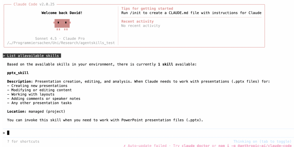
Figure 1: Claude Code lists the skills it has access to.

Background Agent Skills enable an agent to dynamically include knowledge related to different tasks and environments in their context window. Skills are located in the .claude/skills/ folder of a project directory. All skills are represented by a directory that contains a file called SKILL.md . This file starts with the name and description of the skill in YAML format. Below this metadata, the skillfile contains a set of instructions. A skill folder can also contain other files or scripts, which the SKILL.md file can refer to. The name and description attributes are read at model start and loaded into the system prompt. The body of the skill file is loaded only when Claude decides that a skill is relevant. All other files in a skill directory are loaded by Claude when they are called from the SKILL.md .